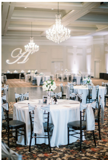
DEVEN ASHLEY PHOTOGRAPHY