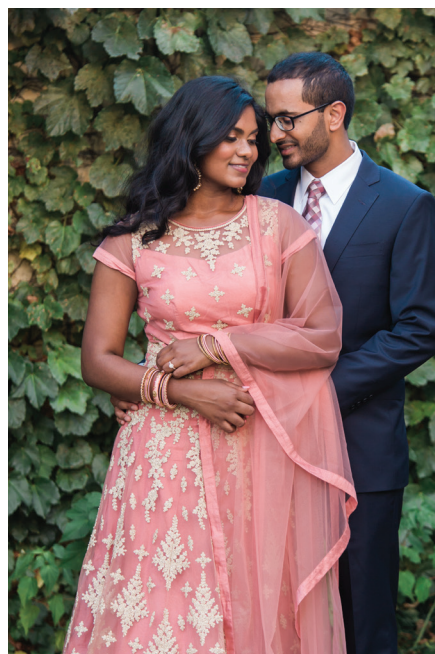
JUST INSPIRED VISUALS