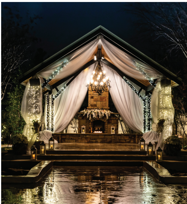
CHRISTINA MCDANIEL PHOTOGRAPHY

While we love walk-ins, please call ahead to schedule an appointment to ensure we can dedicate time to your tour. Tour times listed below are based on our weekly availability and are subject to change.