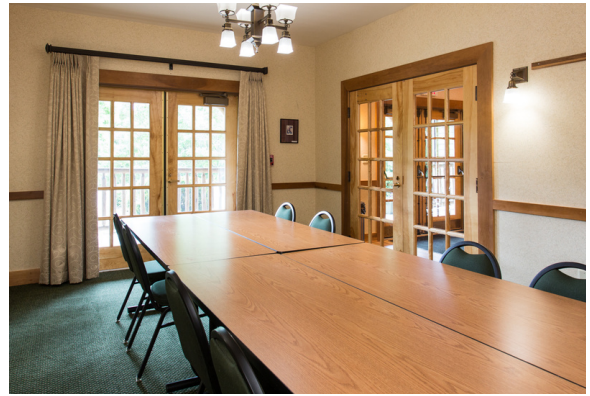
*Additional lodging facilities available for an additional fee.