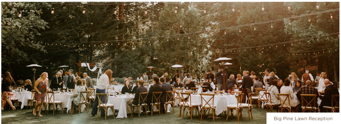
Big Pine Lawn Reception

All rates quoted are per person and are subject to 18% taxable service charge and other applicable state and local taxes. All prices are subject to change. Special dietary requests will be accommodated with advanced notice (special pricing may apply).