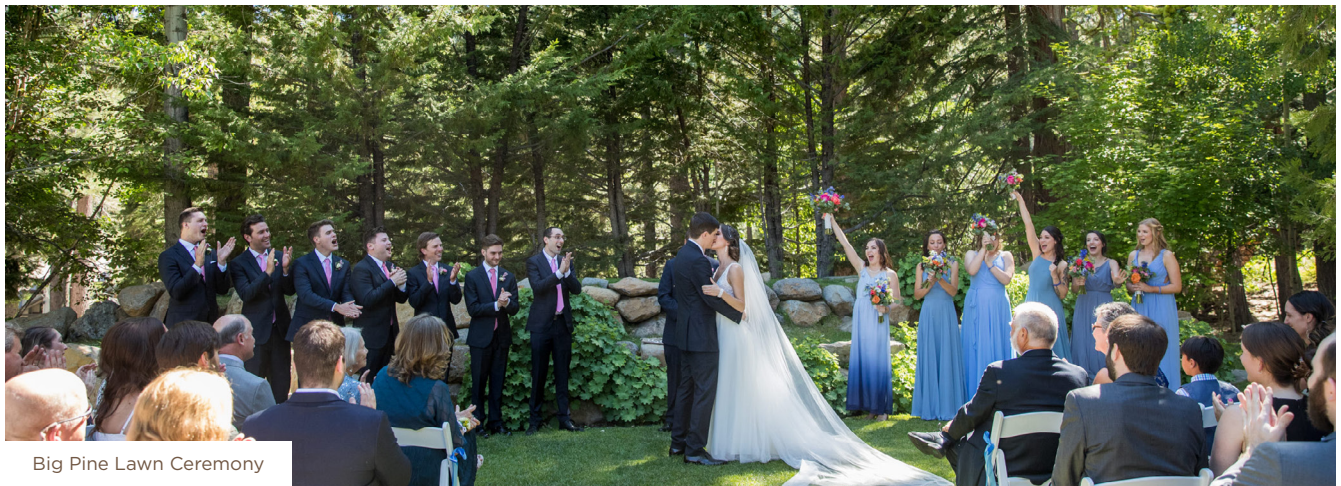
Big Pine Lawn Ceremony

Big Pine rehearsal dinner set up and clean-up is not included, nor is common area cleaning, but is available at a charge of $250 per hour. This service must be arranged two weeks prior to your event.