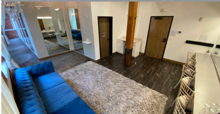
VIP ROOM - THE OXFORD SUITE