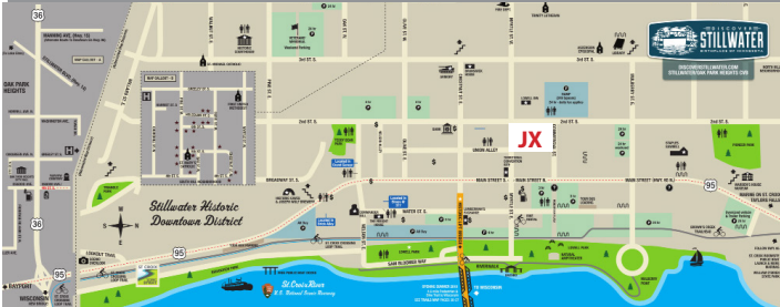
PARKING LOTS 1800+ SPOTS