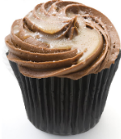
Chocolate Salty Caramel