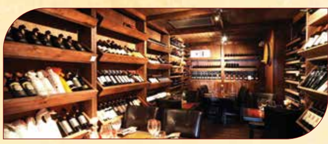
Wine Cellar: For intimate parties of up to 14 guests