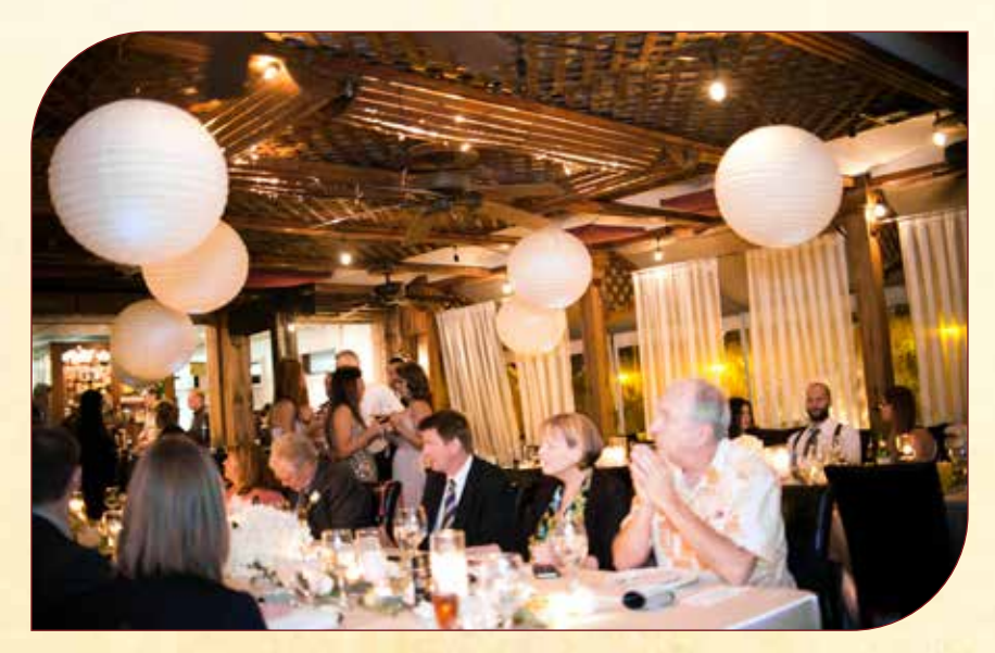
Patio: Climate Controlled Outdoor Patio with seating capacity for up to 70 guests with DJ & dance floor or up to 150 guests with tent extension