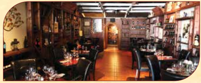
Main Dining Room: A seating capacity for up to 55 guests