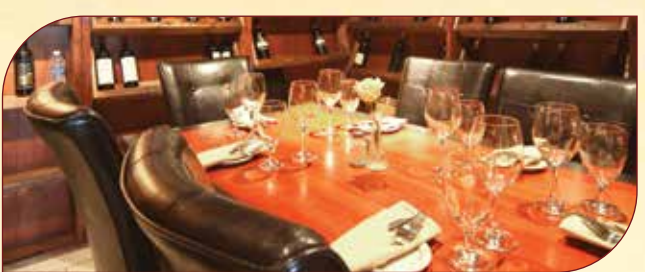
Table 37: A secluded wine cellar, for small parties of up to 8 guests