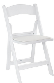
White Resin with padded seat | $2.50