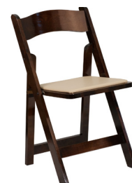
Fruit Wood with padded seat | $3.00