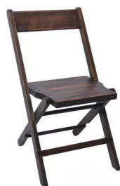
Dark Walnut | $3.00