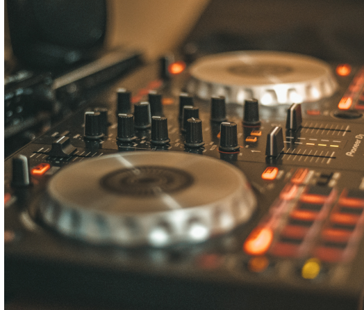
*Some restrictions apply. See Club for details.