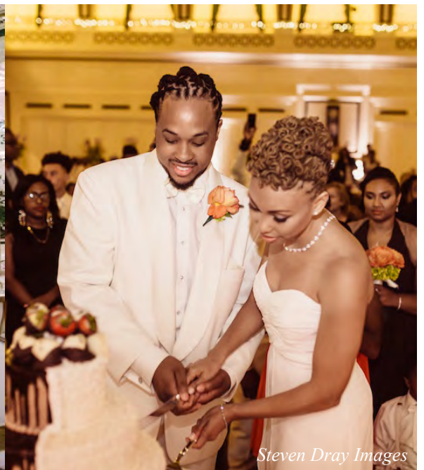
Steven Dray Images