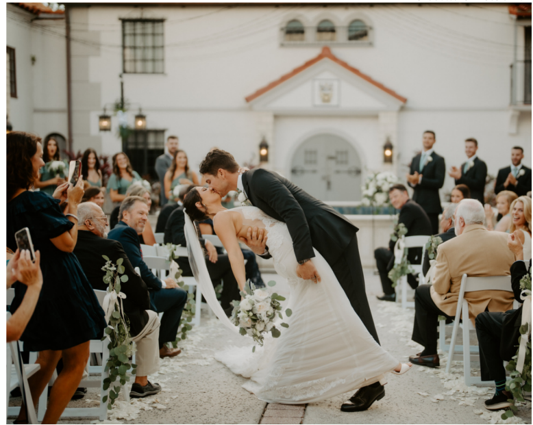
LensCulture Photo & Film