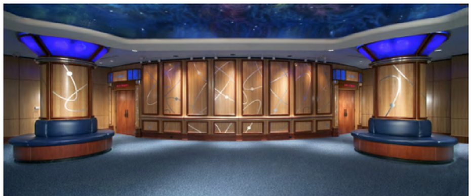
Planetarium Lobby space can be used for cocktail hour