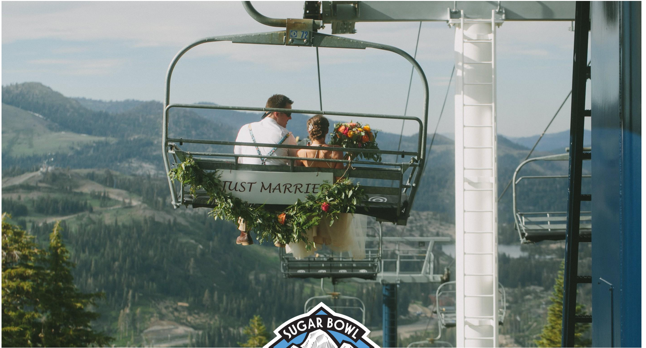
FRONT & BACK COVER BY COURTNEY AARON PHOTOGRAPHY