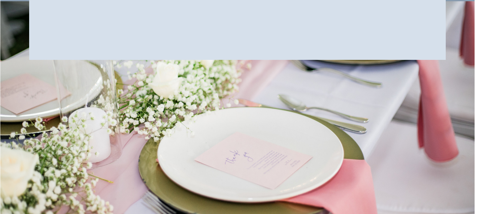
table linens, linen napkins, wine glasses, water goblets, champagne glasses, charger plates, dinnerware, silverware. You choose the colors and styles.