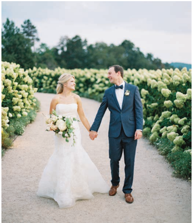
SUMMER WEDDINGS PAGE 17