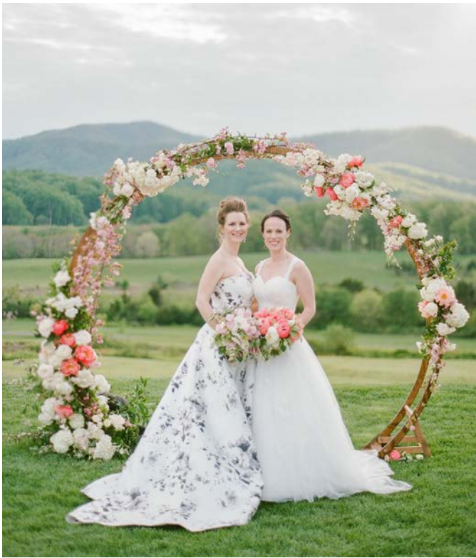
SPRING WEDDINGS PAGE 13