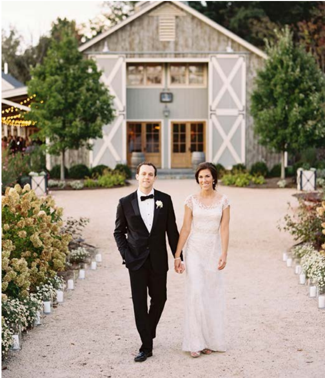
FALL WEDDINGS PAGE 21