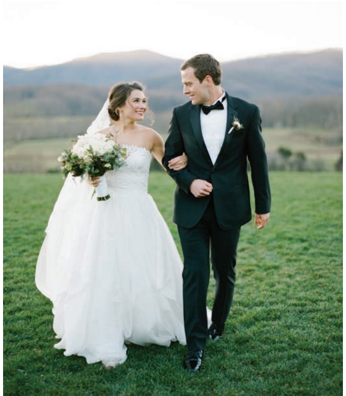
WINTER WEDDINGS PAGE 25