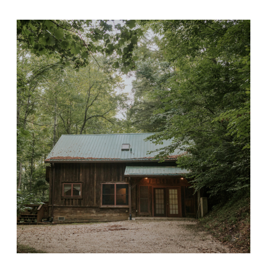
Sitton House 5 bedrooms | 5.5 baths Sleeps 10

Campbell Cabin 6 bedrooms | 6 baths Sleeps 12