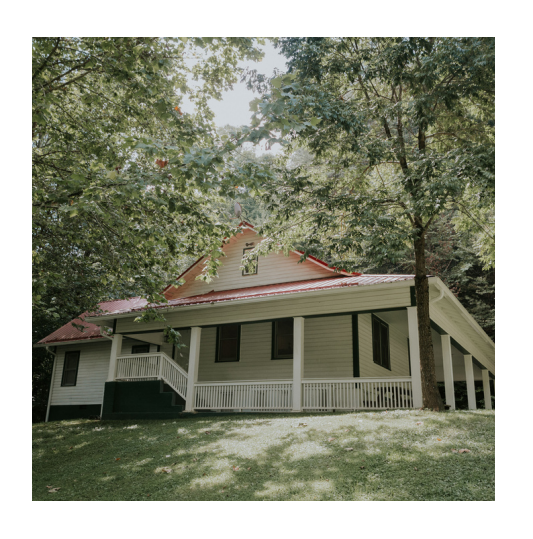
Chest nut Farmhouse 5 bedrooms | 3 baths Sleeps 14