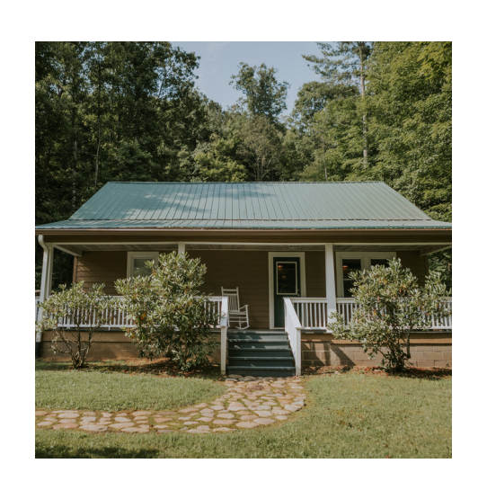
Cherokee House 3 bedrooms | 3 baths | 1 loft Sleeps 8