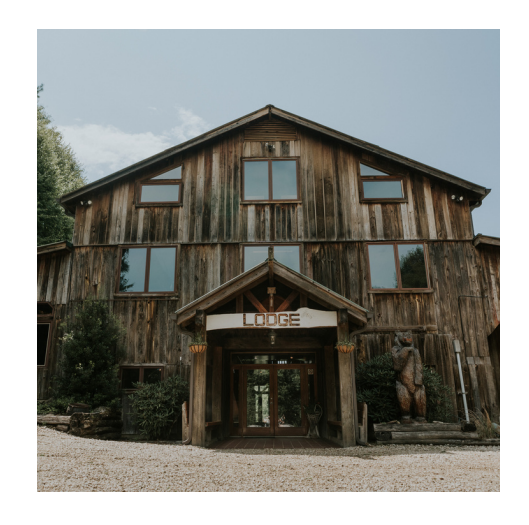
Chest nut Farmhouse 5 bedrooms | 3 baths Sleeps 14