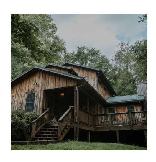
Cherokee House 3 bedrooms | 3 baths | 1 loft Sleeps 8