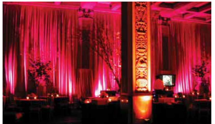
ADDITIONAL ROOM LIGHTING