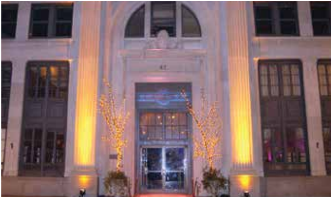
EXTERIOR COLUMN LIGHTING

Product selection and availability cannot be confirmed until a 50% deposit is paid to reserve the items for your event. The final balance will be due 30 days prior to your event for any specialty items.