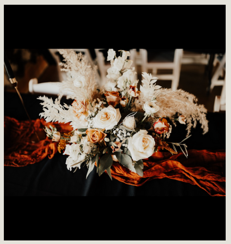
Bridal Bouquet by Honey's Flowers