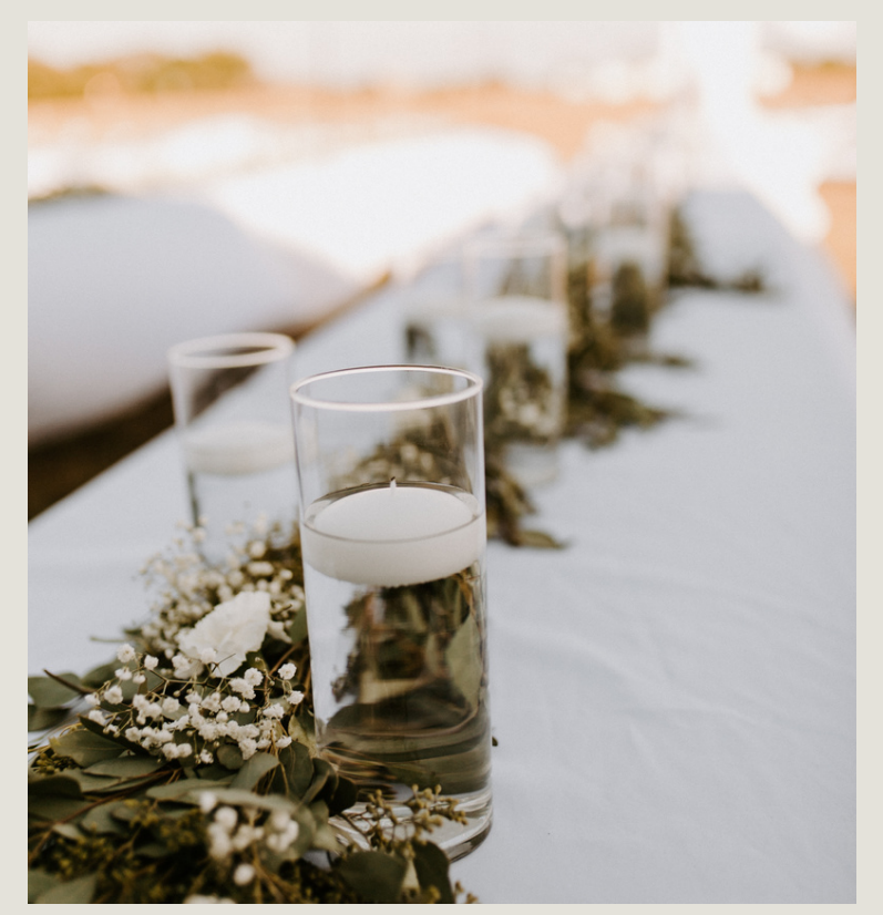
Greenery centerpieces by Honey's Flowers