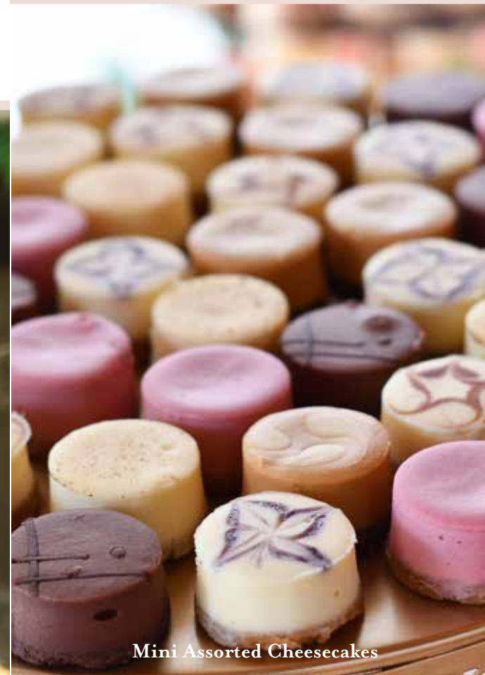
Mini Assorted Cheesecakes