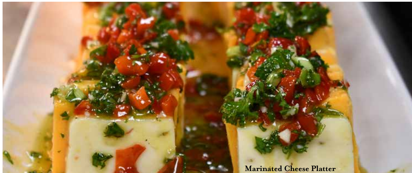
Marinated Cheese Platter

(+ $4 per person) Artistic display of dried fruits, nuts, whole seed mustard, spreads, and gourmet crackers nestled around our Chef's ever evolving selection of artisan cured meats and cheeses. No two trays are ever the same, but always delicious.