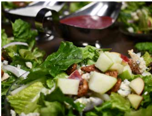
Apple Orchard Salad

Freshly cut romaine with a collection of artisan lettuces drizzled with a creamy poppy seed dressing; garnished with smoked blue cheese crumbles, house made candied pecans, red onions, and fresh apple.