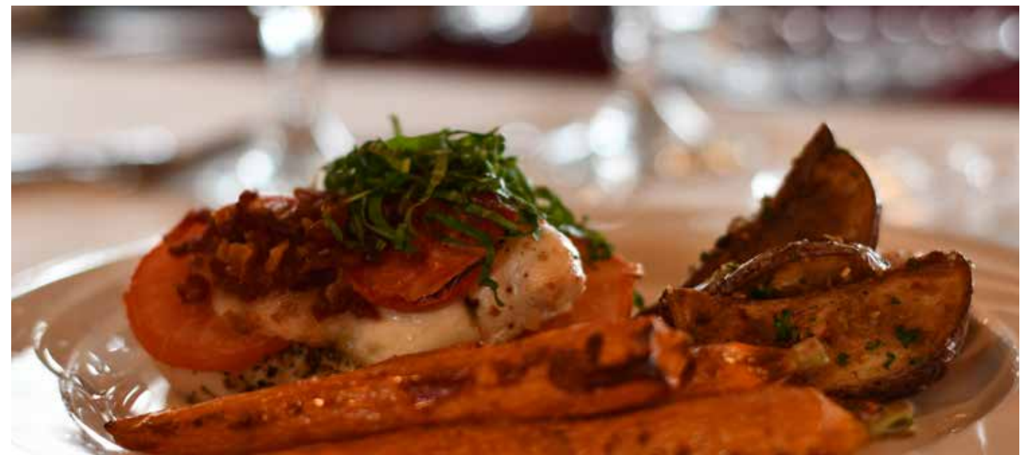
Prosciutto Caprese Chicken with Hot Honey Glazed Carrots and Roasted Red Skin Potato Wedges

USDA Prime Black Angus, 8 ounce filet mignon, hand cut from the tenderloin and aged a minimum of 30 days to enhance flavor then marinated in fresh rosemary, garlic, and Worcestershire sauce. The Filet Mignon is then grilled on cast iron and cooked medium; served with our home made decadent demi-glace sauce.