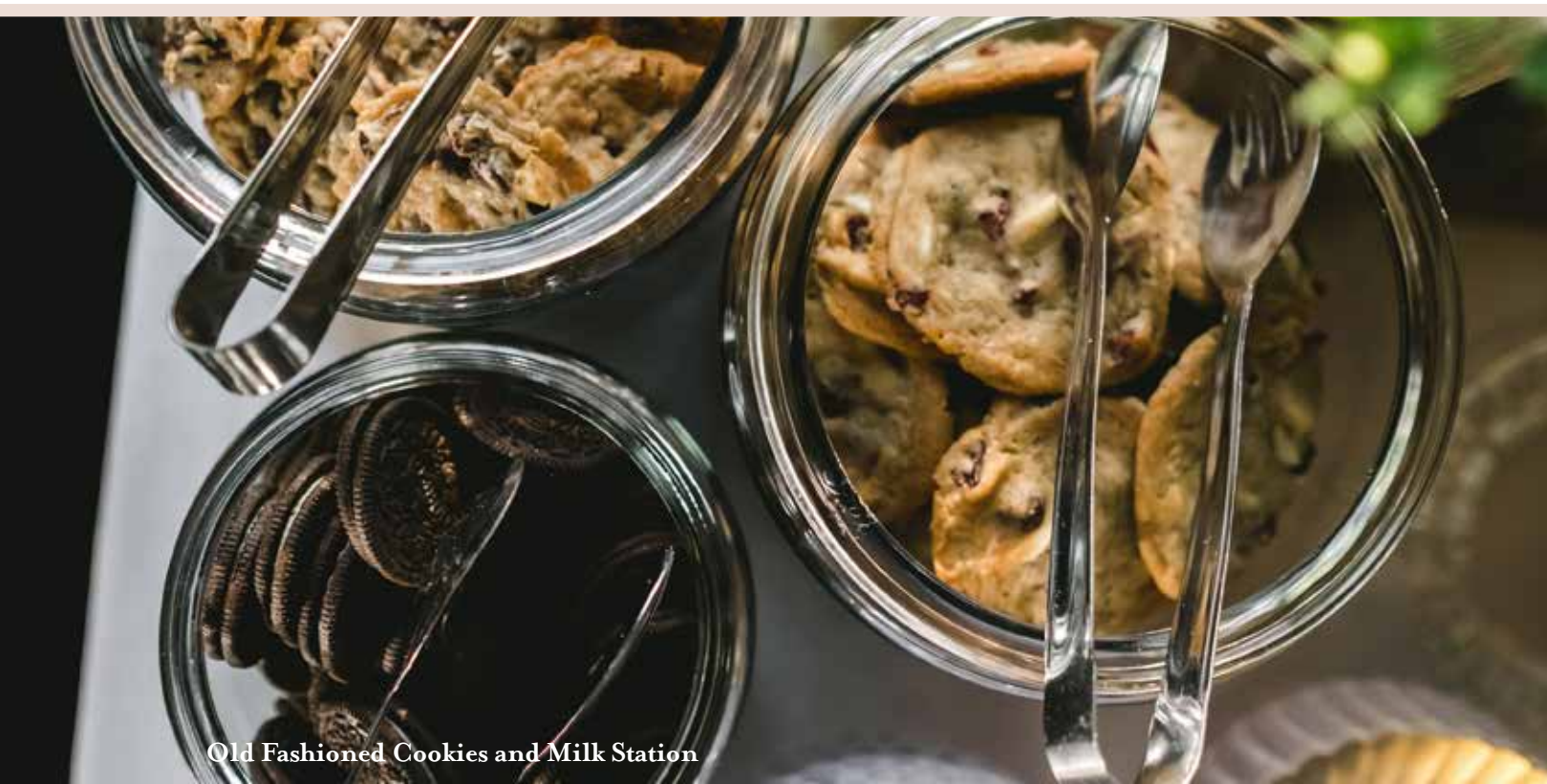
Old Fashioned Cookies and Milk Station

Crispy chicken tenders with traditional fries, BBQ sauce and creamy ranch.