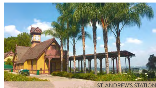
ST. ANDREW'S STATION