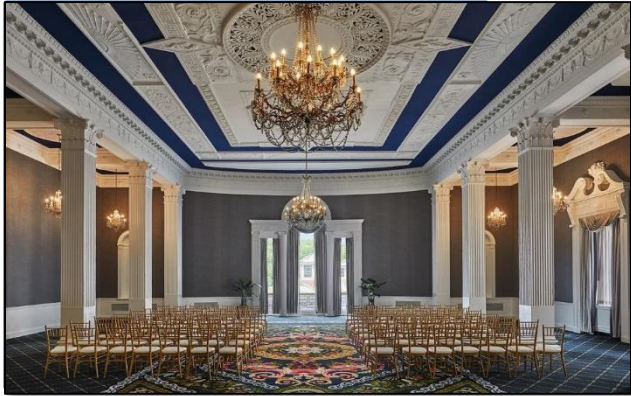
Capital Ballroom $1,000

Graduate Providence , proudly hosts the area's most exquisite weddings each year. Our onsite locations provide the perfect setting for your wedding day ceremony.