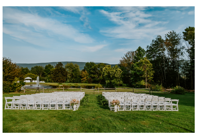
1811 LAWN