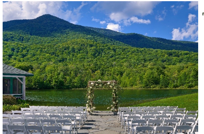
THE POND PAVILION