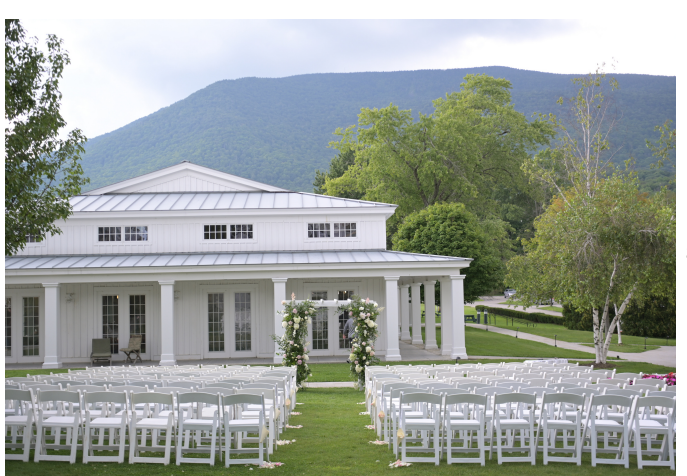
LINCOLN LAWN