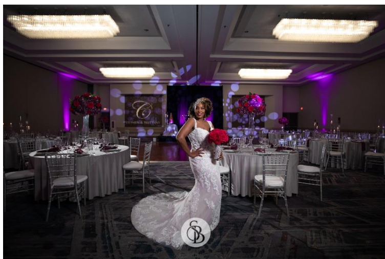
THE WEDDING OF YOUR DREAMS