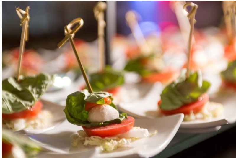
INSPIRED CULINARY CREATIONS