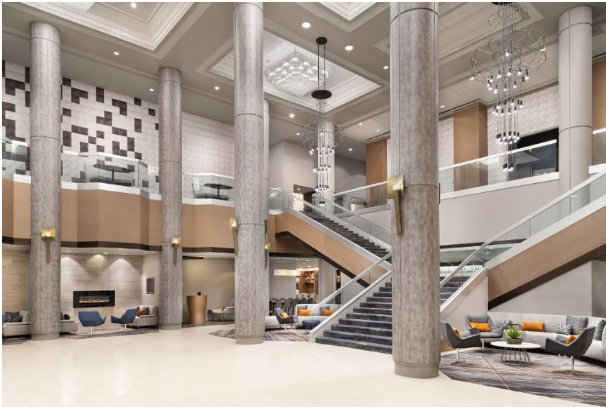
GRAND HOTEL LOBBY