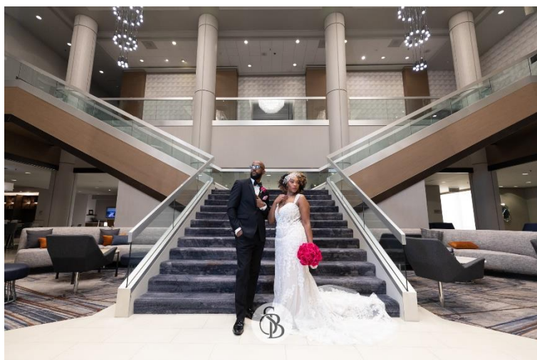
MODERN ELEGANT DECOR