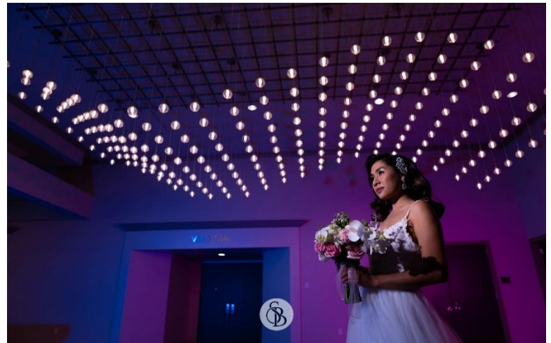
VAST LOBBY AREA