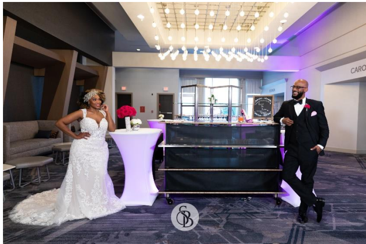
CREATIVE COCKTAIL HOURS