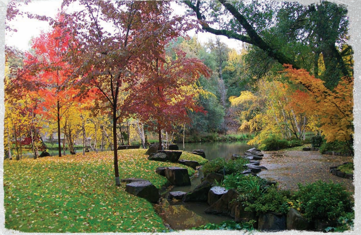
Lakeside Park Seating up to 150 guests