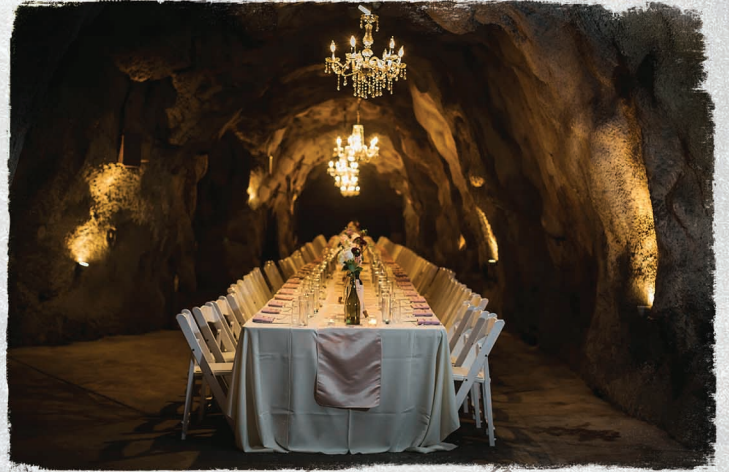
Garden Breezeway & Wine Cave Seating up to 200 guests