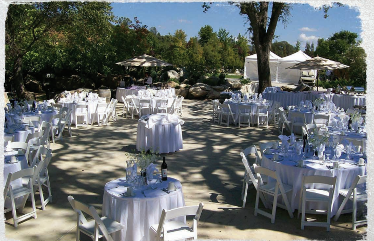
Rock Garden Seating up to 100 guests