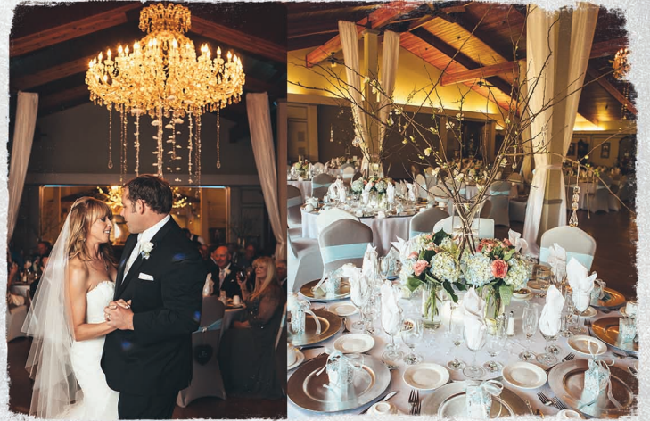
Alhambra Music Room Seating up to 200 guests