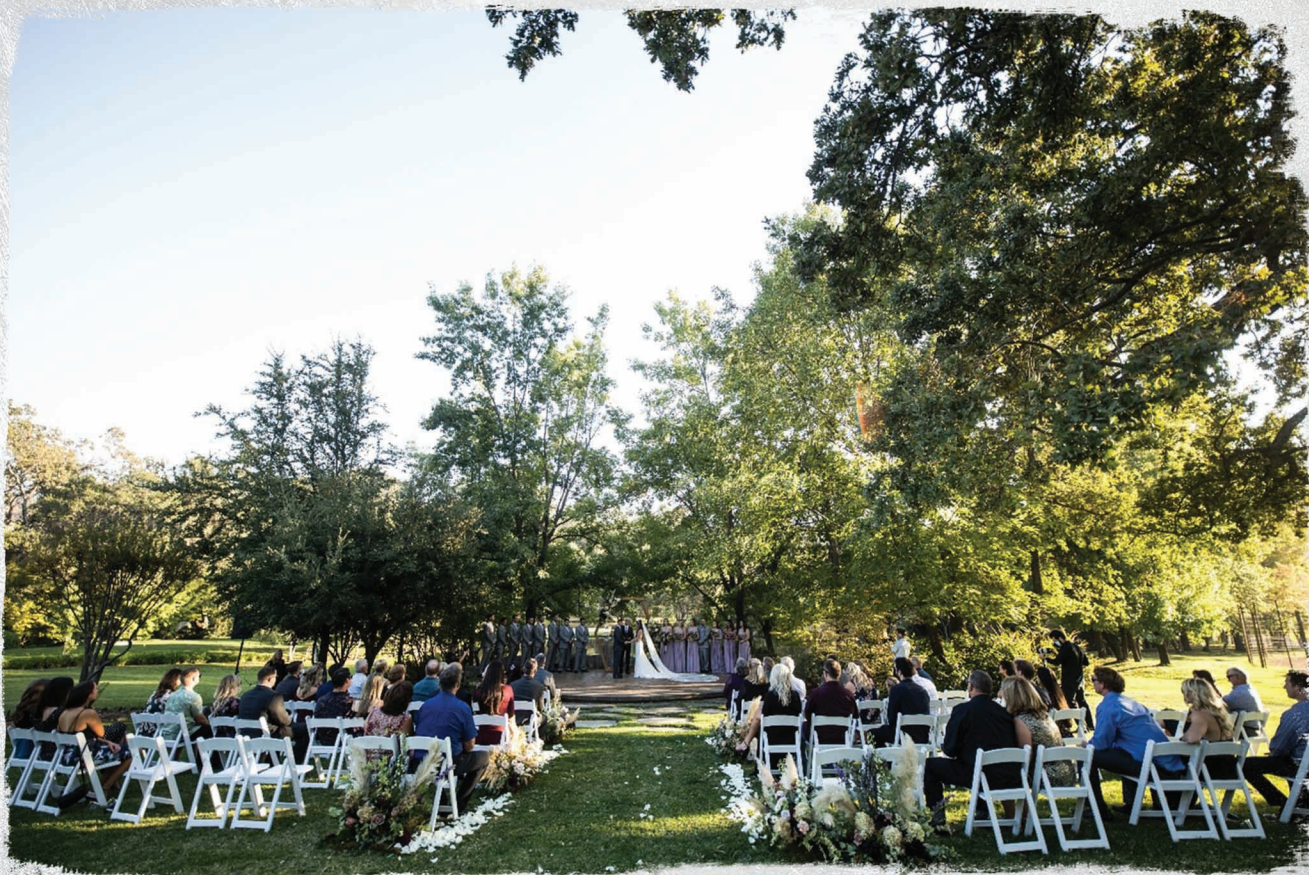
Princess Bride Lawn Seating up to 500 guests