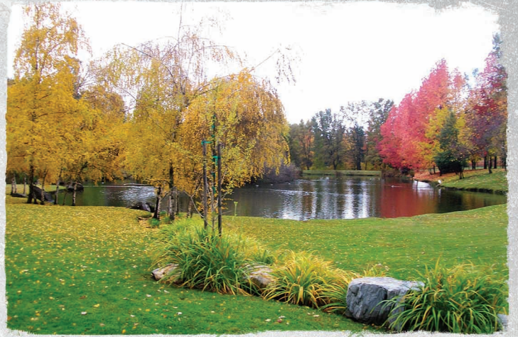
Lakeside Lawn Seating up to 300 guests