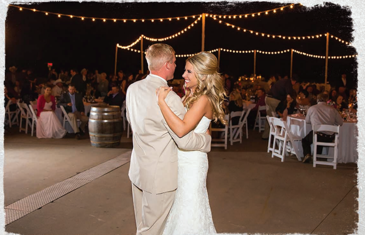
Amfitheatre Seating up to 480 guests