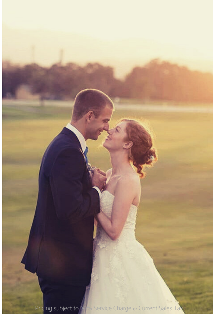
Pricing subject to 20% Service Charge & Current Sales Tax