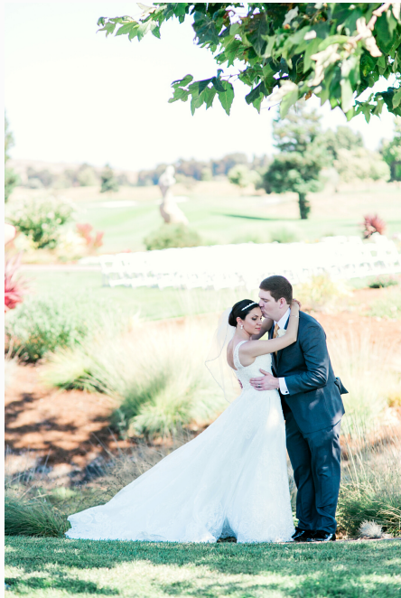
Friday & Sunday

Private use of our Tranquil Ceremony Garden | 200 White Garden Chairs | Golf Carts One hour rehearsal | Use of bridal suite | Use of arch