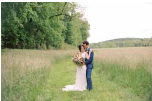
Shea Brianne Photography

Pricing subject to change without notice. Above pricing does not include sales tax.