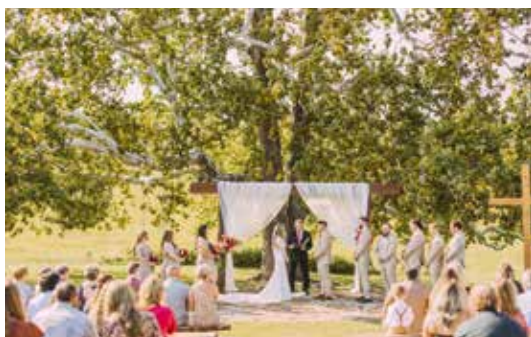
Hope's Perspective Photography

Pricing subject to change without notice. Above pricing does not include sales tax.