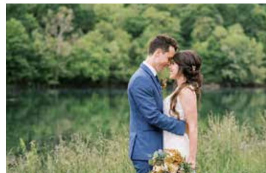
Shea Brianne Photography

Sycamore Creek | Your Wedding At Sycamore Creek