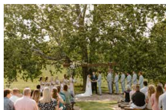
Inner Images Photography

Pricing subject to change without notice. Above pricing does not include sales tax.