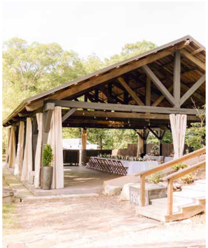
Sycamore Creek | Summer Weddings | Shiloh Ridge Venue