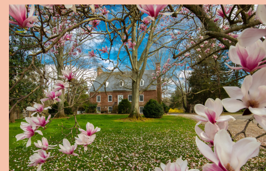
Bel Air Historic Manor