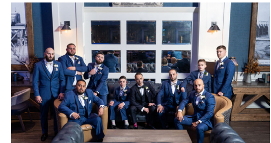
JK Rose Photo & Video