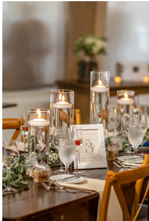
Red Bank Studio Photography