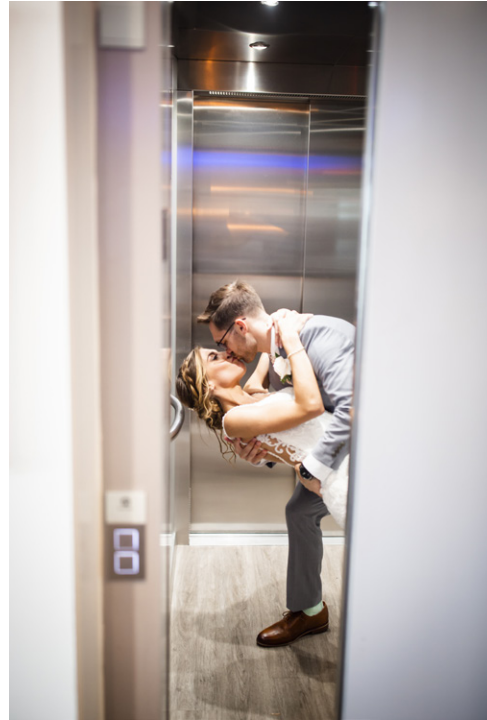
Wedding Bug Studios