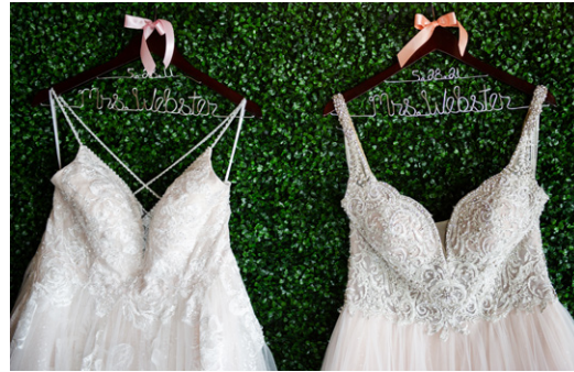
LeAnna Theresa Photography