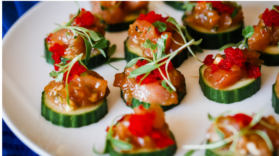
Wedding Bug Studios

chilled colossal shrimp, fresh horseradish cocktail tuna tartare, tobiko, cucumber, yuzu lobster rangoon, curry & chive prosciutto wrapped pineapple, saba glaze seasonal fruit tart, whipped mascarpone, evoo roasted pear crostini, truffle cheese, bacon jam confit tomato toast, romesco sauce, marcona almond