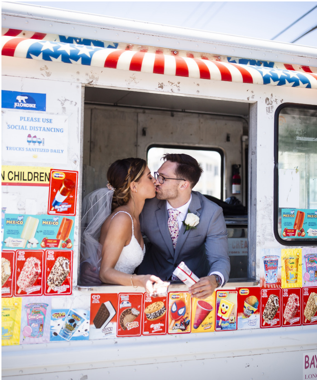
Wedding Bug Studios