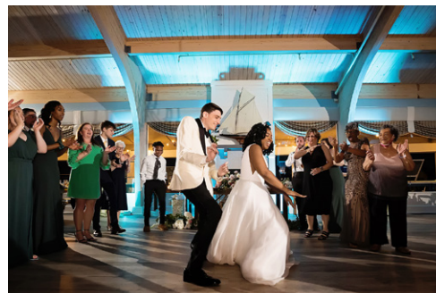
Beau Ridge Photography