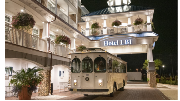
Studio 63 Photography