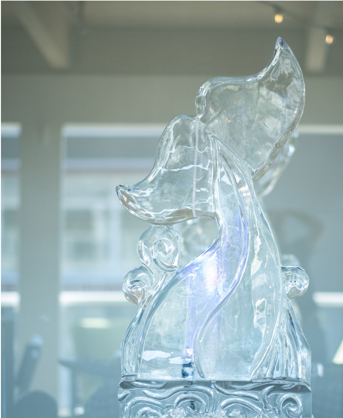
Red Bank Studio Photography