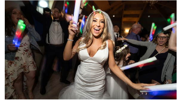
JK Rose Photo & Video