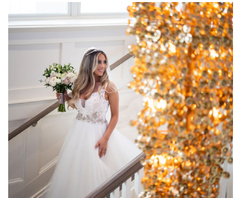
JK Rose Photo & Video