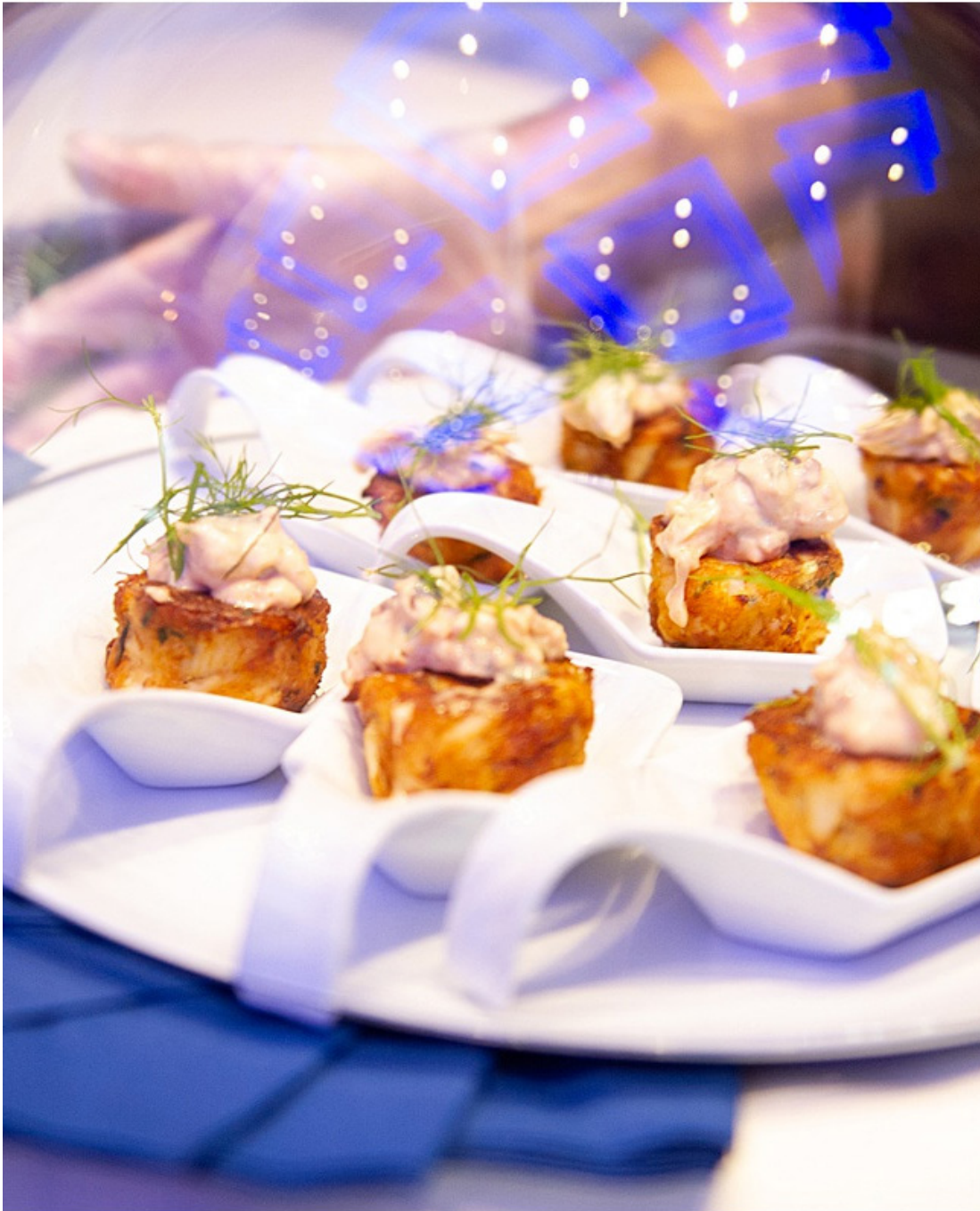
LeAnna Theresa Photography