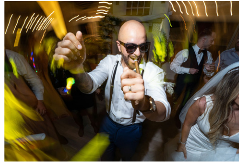
JK Rose Photo & Video