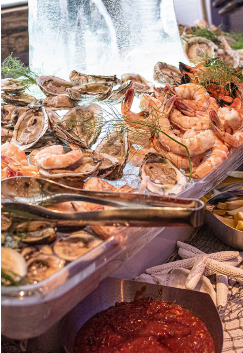
Studio 63 Photography