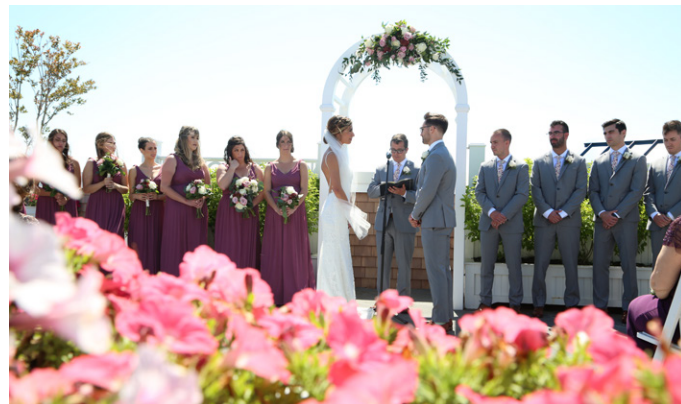
Wedding Bug Studios