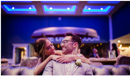
Wedding Bug Studios