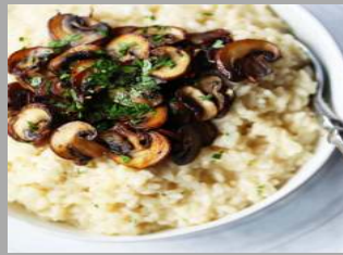
Risotto with mushrooms