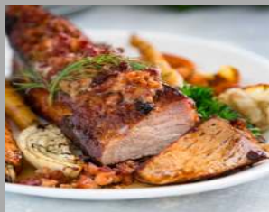
Roasted pork loin