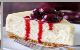
Cheesecake Old Fashioned