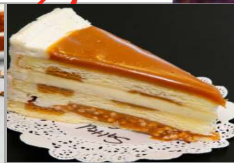
Caramel Vanilla cake