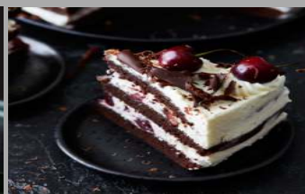
Black Forest cake