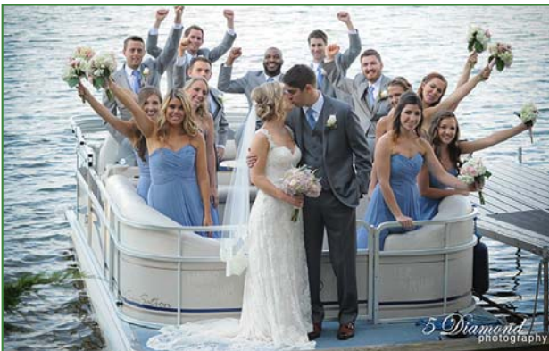
5 Diamond photography