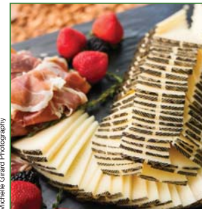
Michelle Grand Photography