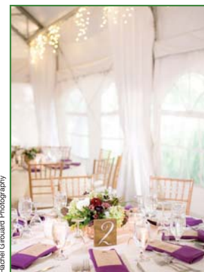
Rachel Ground Photography