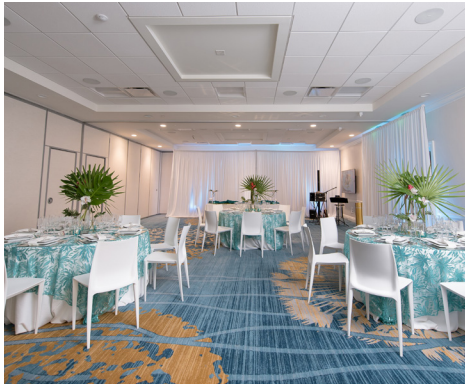
HALF BANQUET ROOM