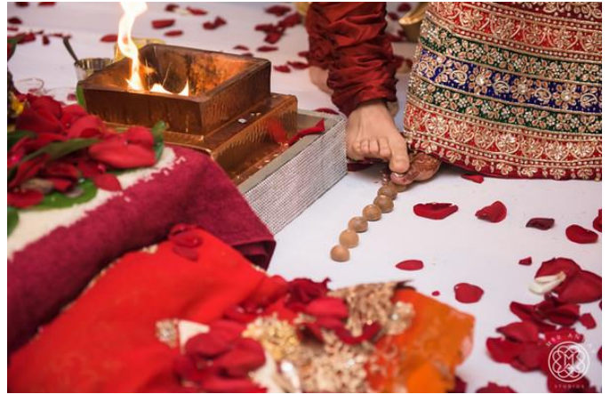
CEREMONIAL FIRE wedding