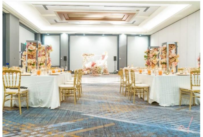
PORTION OF TRINITY BALLROOM