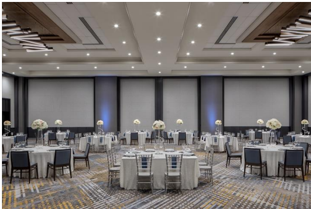
TRINITY RIVER BALLROOM