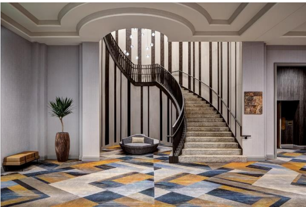
GRAND STAIRCASE FOR PHOTOS