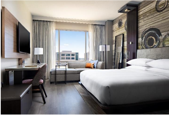
KING GUEST ROOM