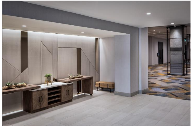
TRINITY RIVER RECEPTION