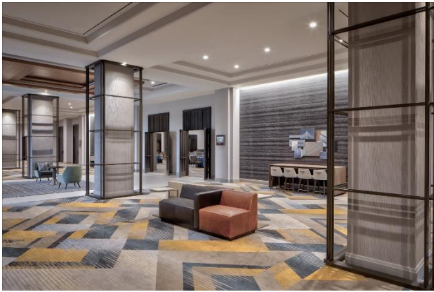
TRINITY RIVER FOYER