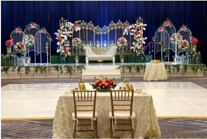
WEDDING COUPLE TABLE