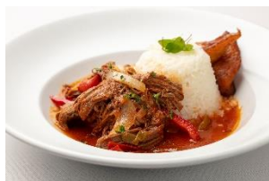
Ropa Vieja (Shredded Beef)