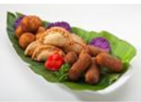
Hot Hor d'Oeuvres