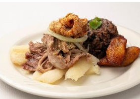
Lechón (Pulled Pork)