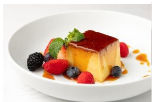
Flan (Caramel Custard)