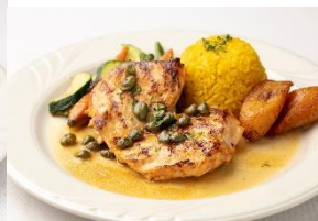
Lemon Caper Chicken