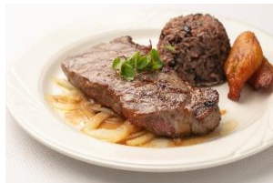
New York Steak