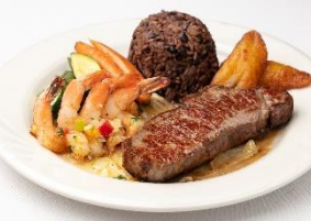
NY Steak & Scampi