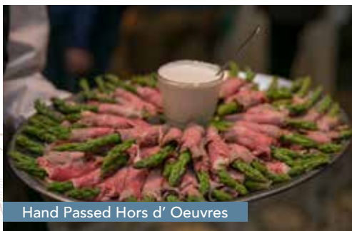
Hand Passed Hors d' Oeuvres

Soda and Alcohol Beverage Services Available at an Additional Charge