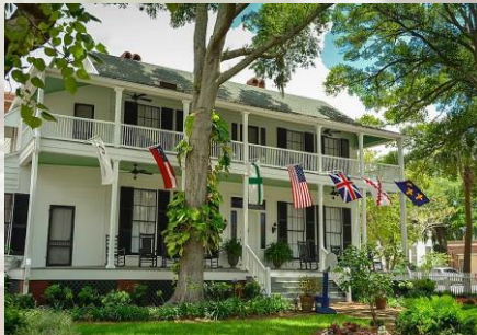
The Lesesne House