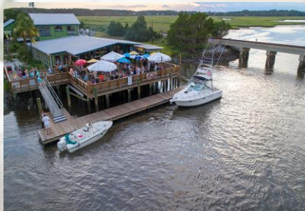
The Down Under