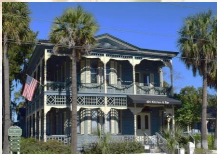
The Bell House