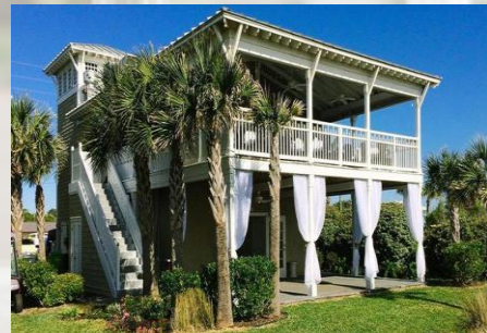
The Ocean Club of Amelia