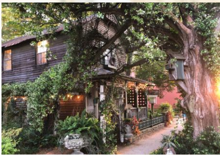
The Secret Garden on Ash