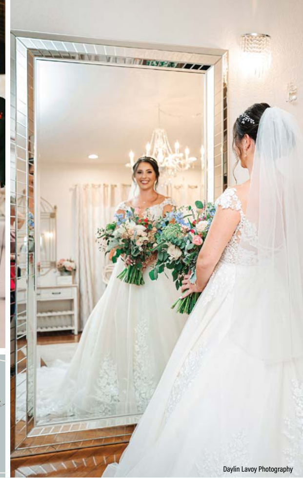
Daylin Lavoy Photography