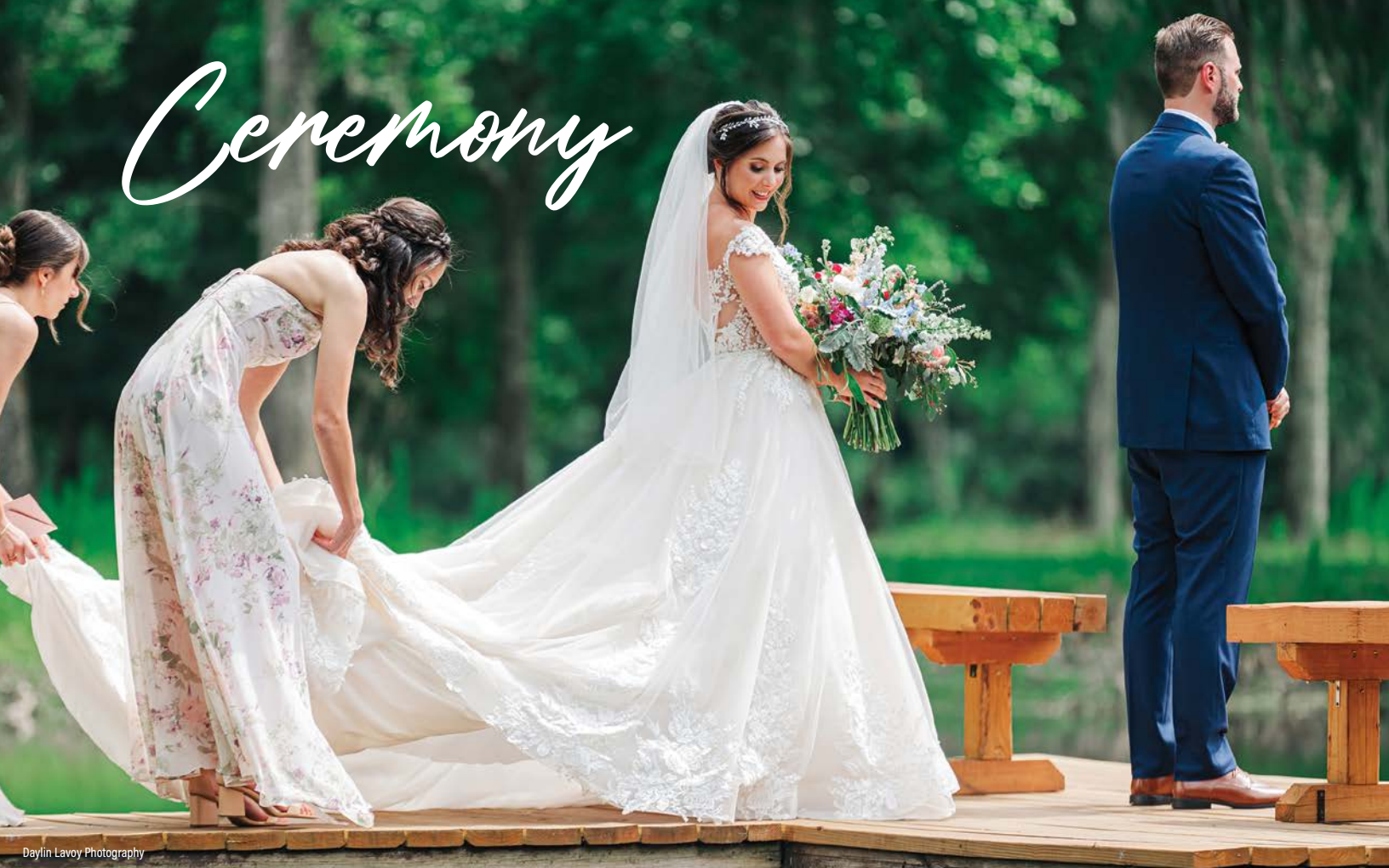
Daylin Lavoy Photography