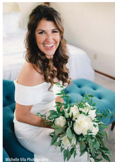
Michelle Vila Photography