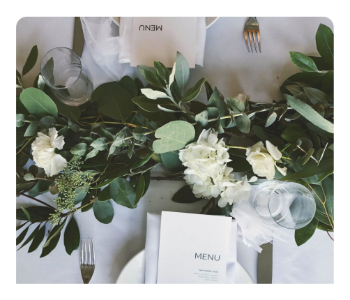
Green Table Garlands