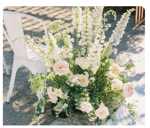
Floral Ceremony Aisle 2 Aisle pieces included