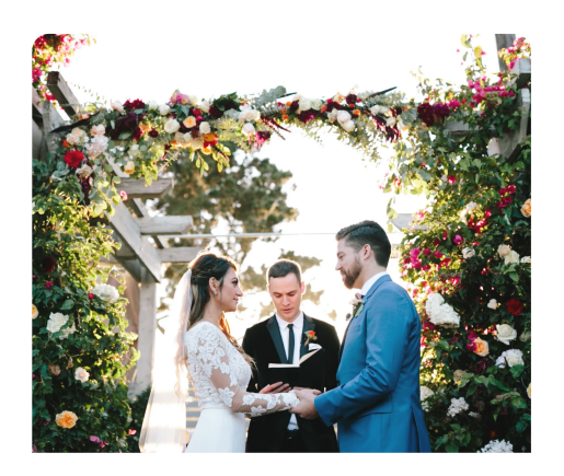
Floral Ceremony Arch