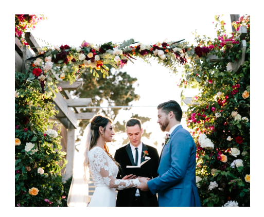
Floral Ceremony Arch