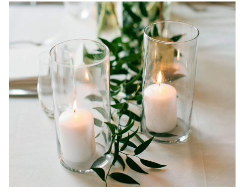
Lanterns + Votives