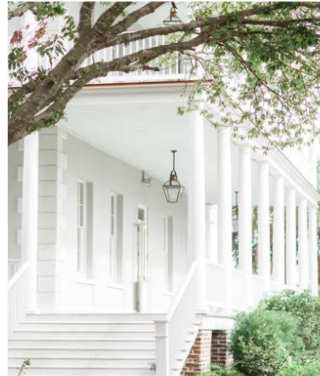
the gadsden house