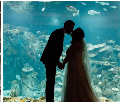
Malawi: Toledo Zoo & Aquariun