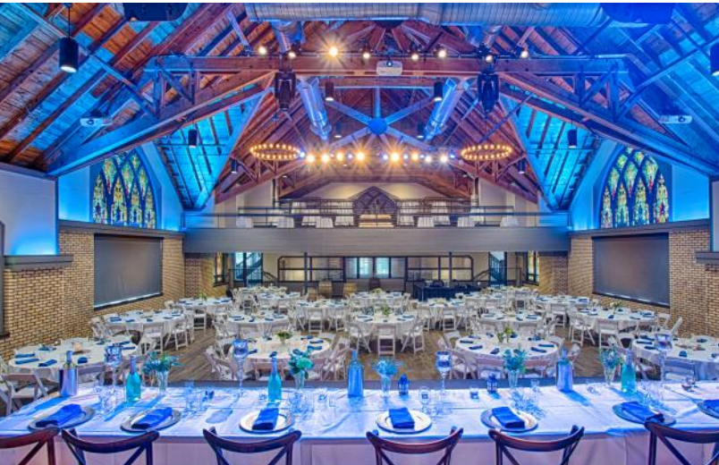
Stage View Seating 150 Guests