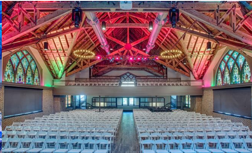
Stage View Seating 375 Guests