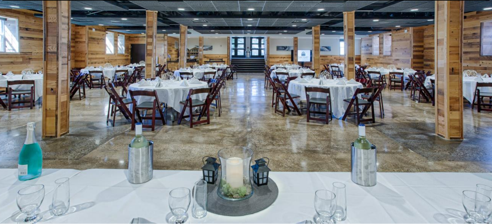
Elegant Dinner Seating up to 225 Guests at Round Tables