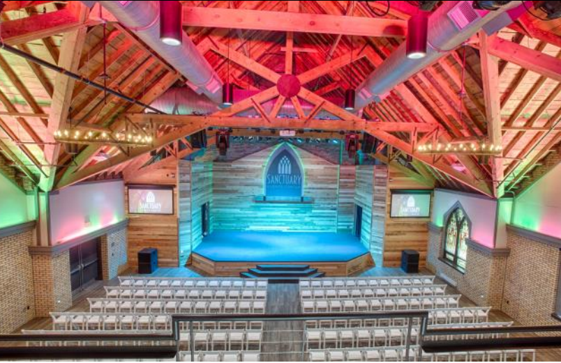
Balcony View Seating 375 Guests