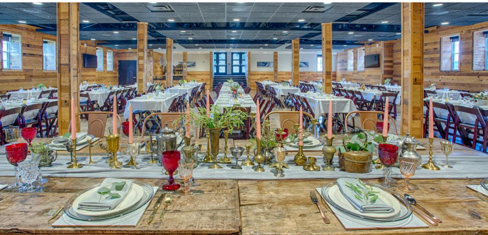
Formal Dinner Seating up to 300 Guests at Rectangular Tables