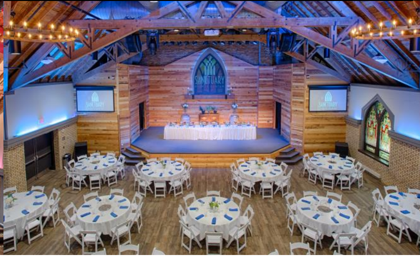
Dinner Seating Round Tables 150 Guests