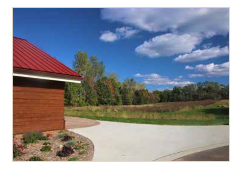
Spring and summer flowers offer beautiful accents for your wedding. While the fall leaves offer great backdrops for your wedding photos. (Pictured Above)