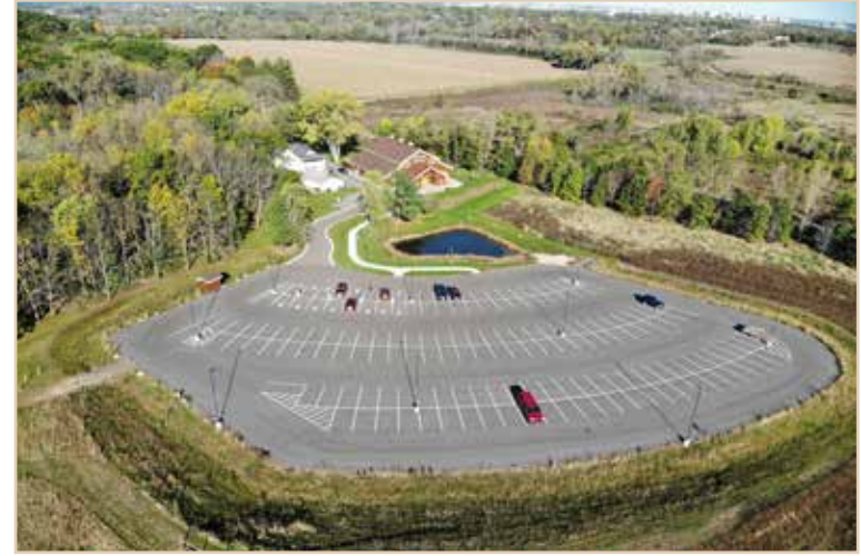
Aerial photo of Barnwood Events shows both the barn and the mass of parking available to your guests. (Pictured Above)