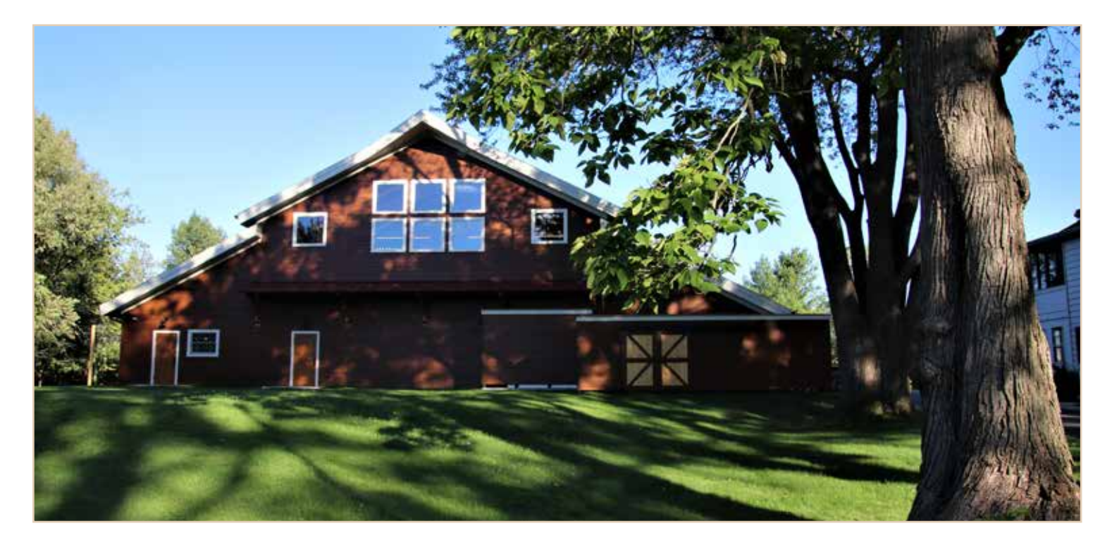
Barnwood Events features some of the oldest trees in the state. With many beautiful trees creating a great backdrop for your wedding. (Pictured Above)