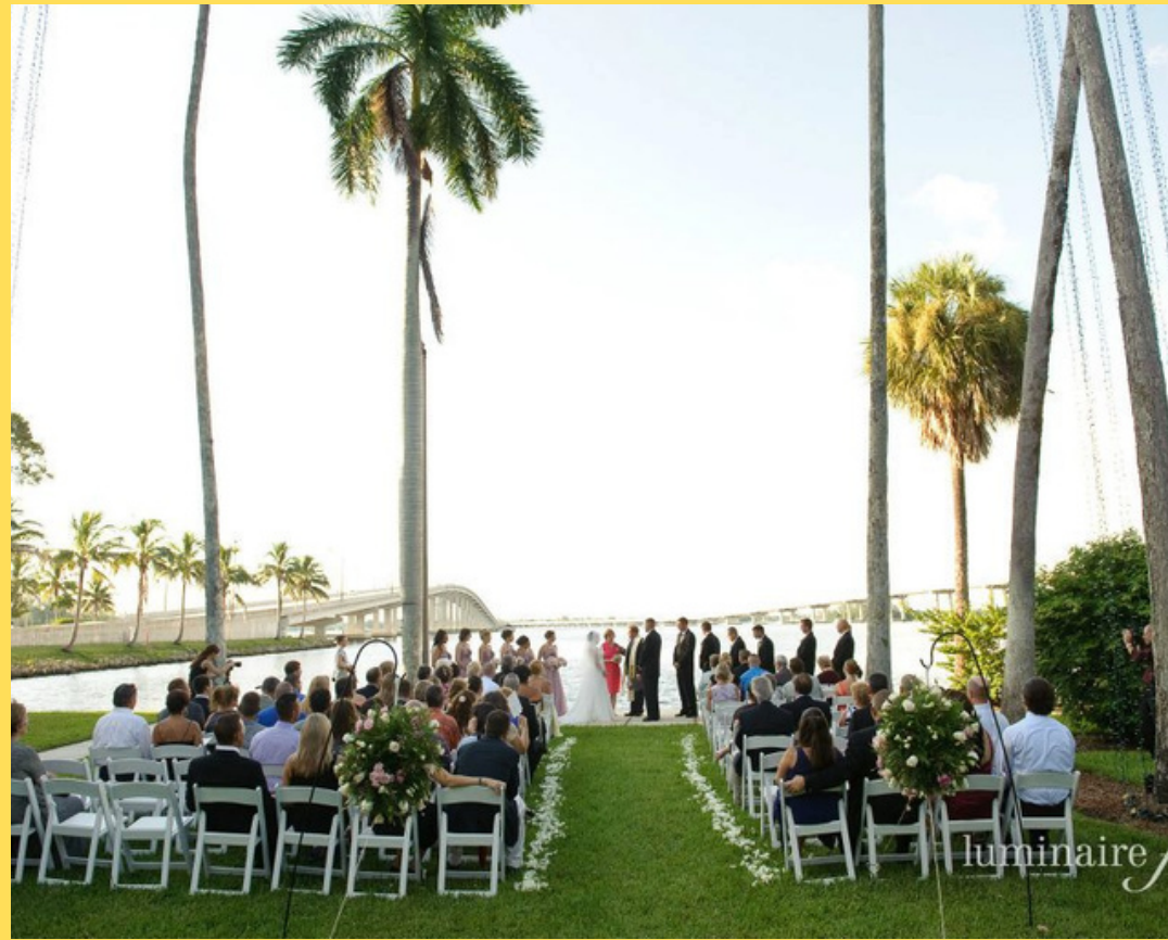
Water View Ceremony