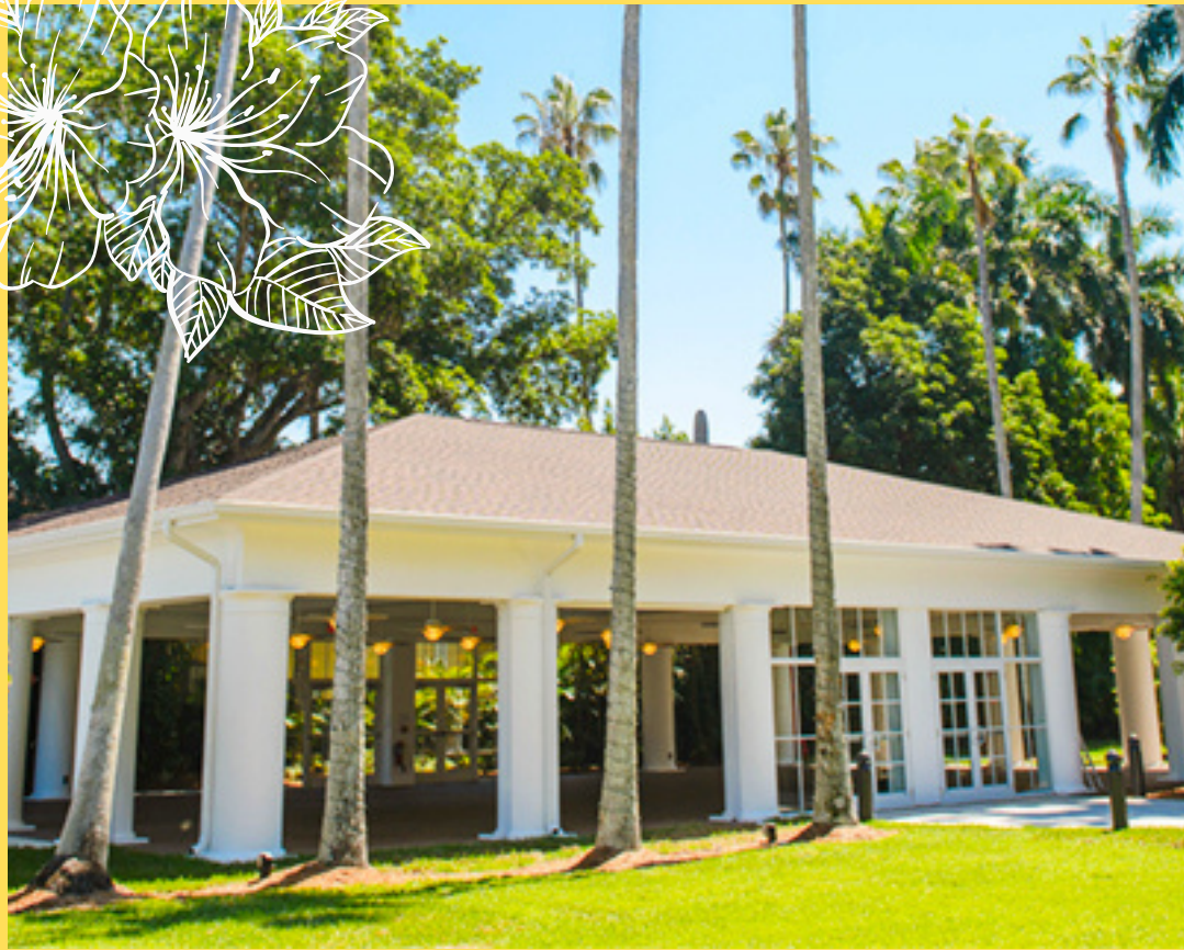
Gale McBride Pavilion