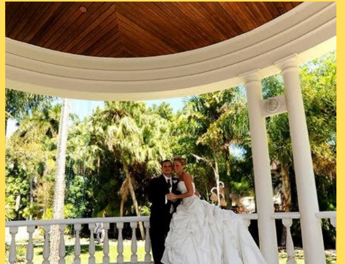
Porch First Looks